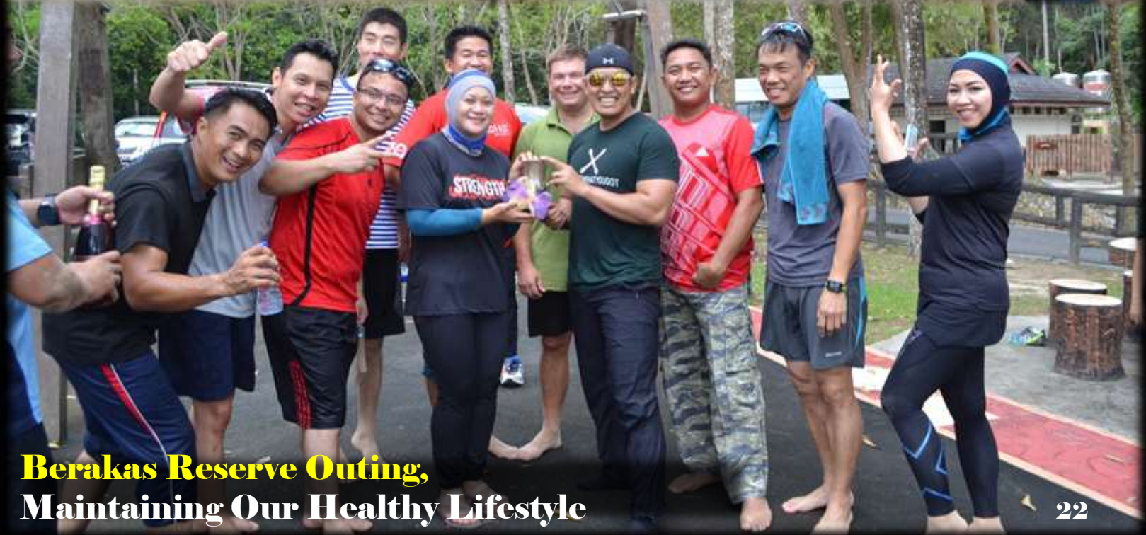
Berakas Reserve Outing, Maintaining Our Healthy Lifestyle