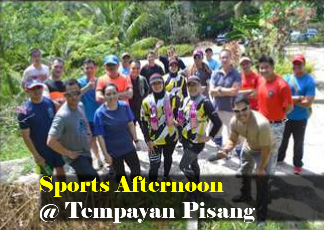
Sports Afternoon @ Tempayan Pisang